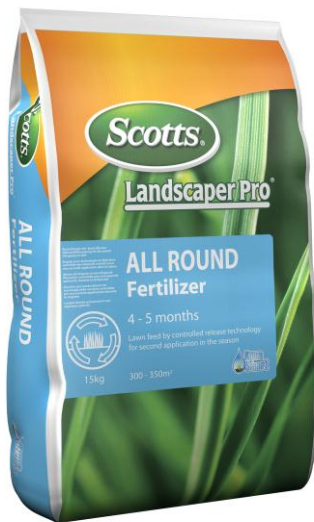
New packaging Q2 2012